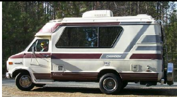
Second Generation 1988 Chinook Concourse 18+