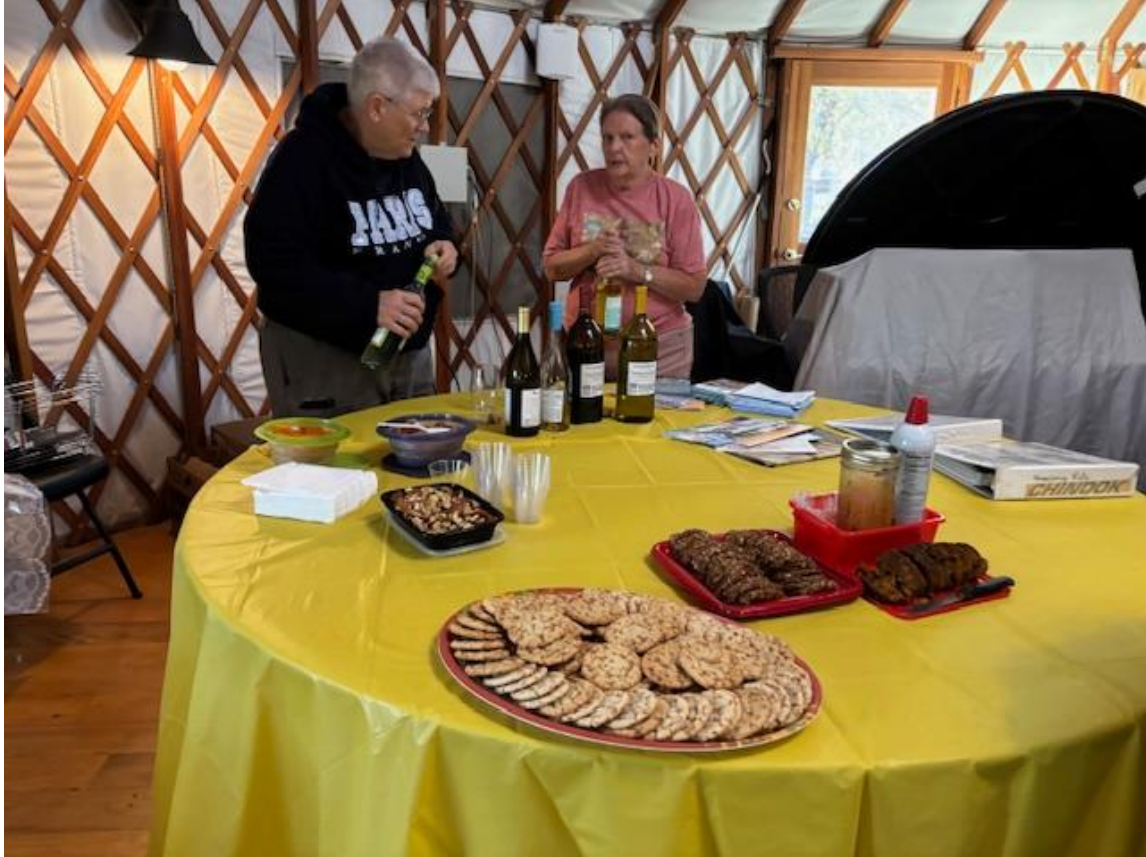
Pot Luck dinner in the Yurt.