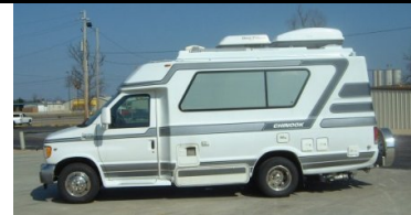
Third Generation 1998 Chinook Concourse XL

Check out the complete history of Chinooks from the beginning in 1938 and see how they evolved over the years. It's a great story! https://tincantourists.com/wiki/chinook/