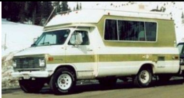
First Generation 1971 Chinook 18 Plus