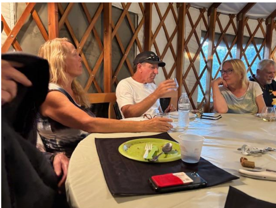
Dinner in the Yurt