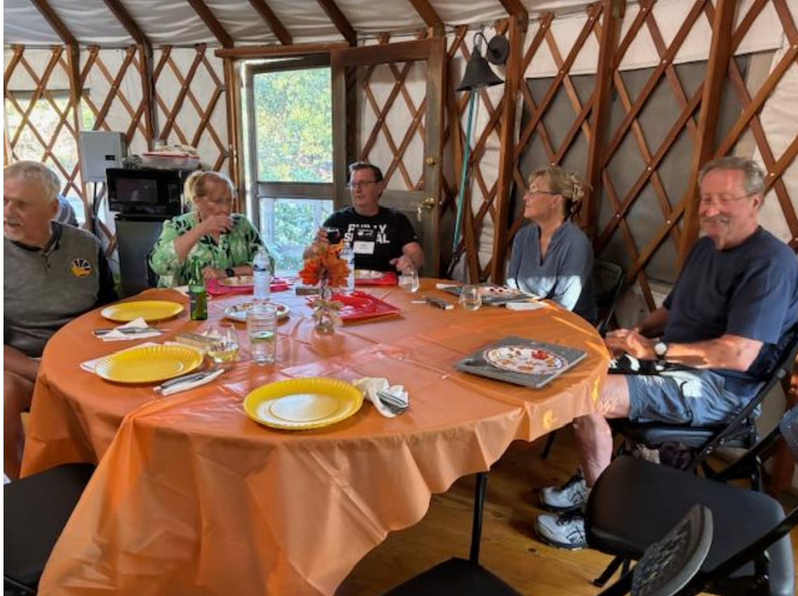
Dinner in the Yurt.