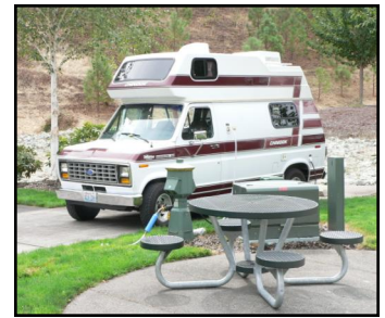
1990 Chinook Voyager