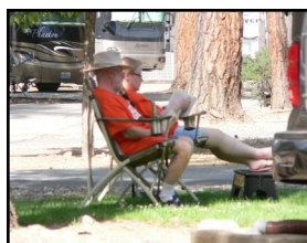
Just peaceful relaxing