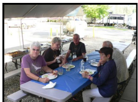
Hosts eating outside