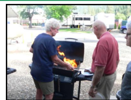
“Bob, want more fire?”