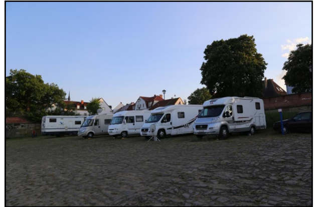
RV's along the river at Torgau, Germany

So, have a nice safe summer and we will see you in the fall.