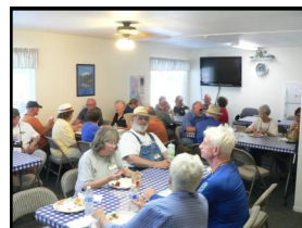
And more potlucks