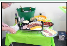
Meet & Greet Spread