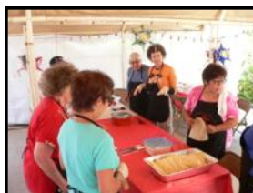
Tamale instructions "Make sure it goes this way"