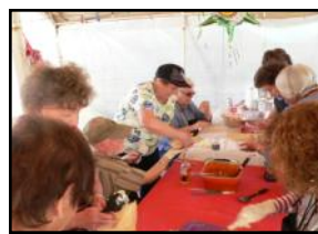
Tamale production line