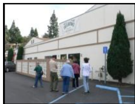
Entrance to Deering Banjo Factory