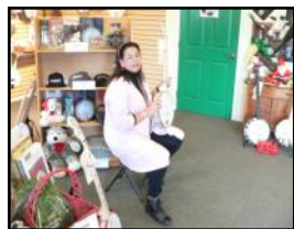
Our wonderful guide for our private tour