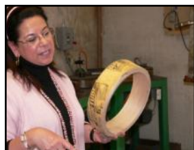
Bent and ready for gluing