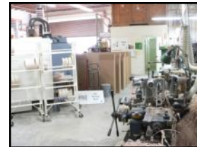
Some unfinished bodies