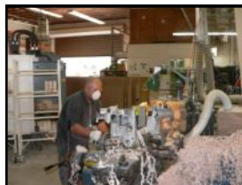
One of the wood lathes What a mess!