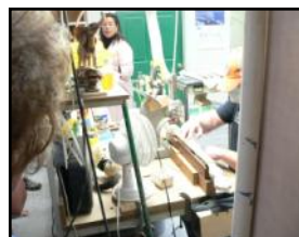
Hand inserting frets on banjo neck