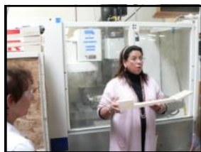
Necks made on CNC lumber waiting for