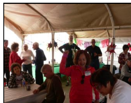
Yes, Lets dance