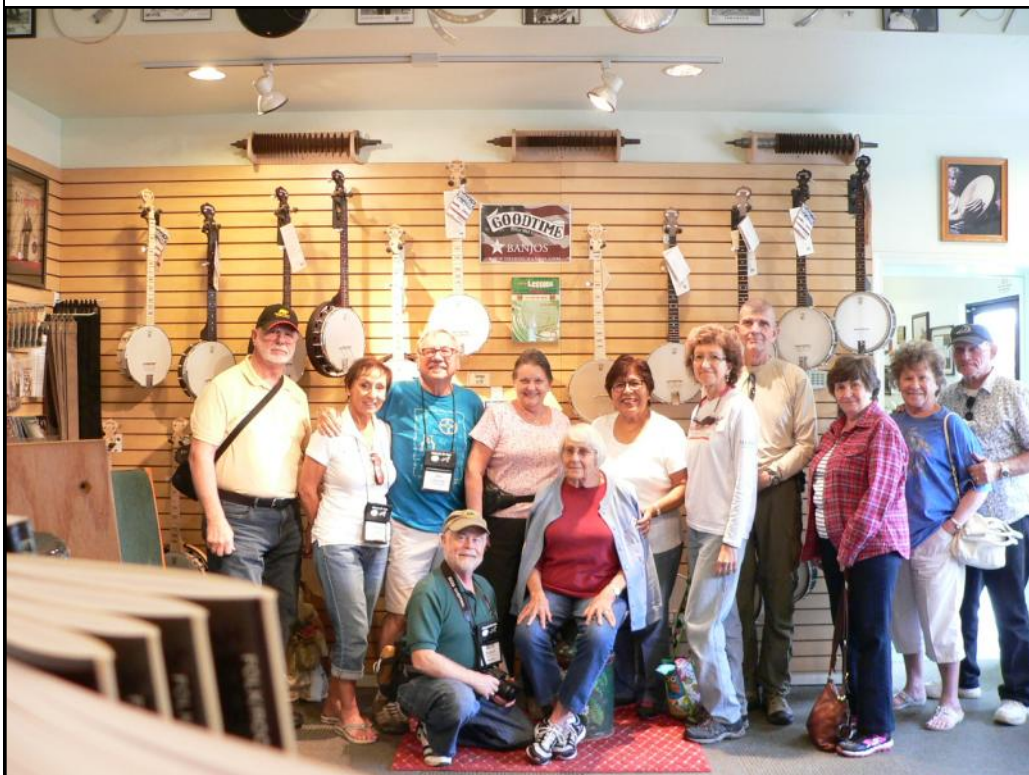
Group all ready to tour the Deering Banjo Factory