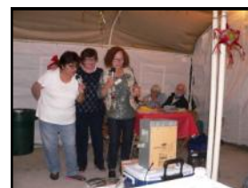
"Yeah, we can do it!"