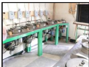
Heated machines for bending wood for body