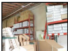
Finished awaiting shipment