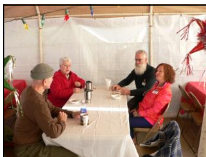
Morning dawns with fresh coffee