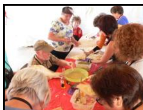
More Tomale action