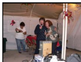
Two brave souls trying