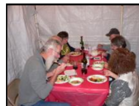
One of many meals we enjoyed