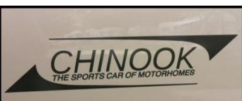
New logo right rear New decal logo on rear: Note: "The sports car of motorhomes" under logo