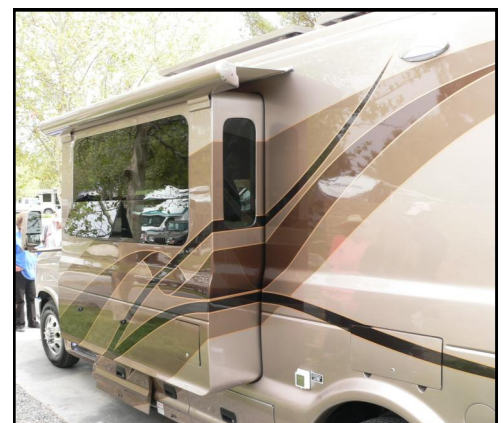
Slide out extended No exposed fiberglass, full body paint