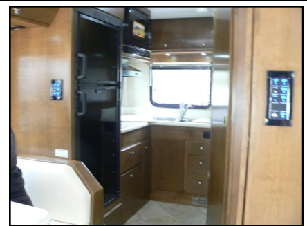
Kitchen with refrigerator, microwave