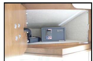
Storage behind TV with digital safe