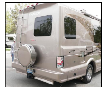
All windows flush with surface