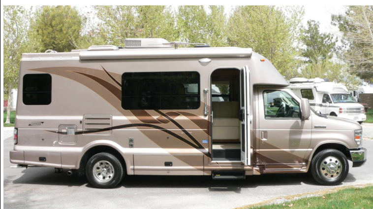
New 2014 Chinook Glacier Prototype More photos on page 8-9