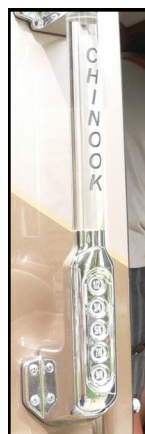
Digital lighted entry handle