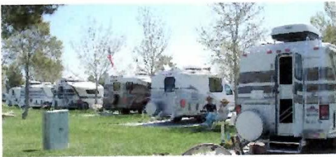
Chinook RV Club