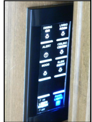
Typical lighting controls