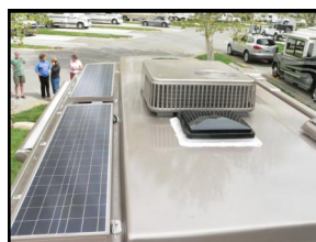
Two solar panels on roof Low profile A/C