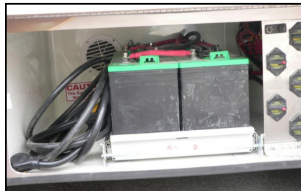
Four 6 volt batteries Stowed cord