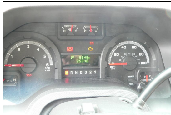
Instrument panel, Tachometer, Digital mileage, Showing 25 thousand miles, full instruments