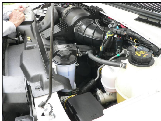
Ford E450 Chassis with 360HP V-10