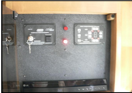
HWH Control panel entertainment ctr