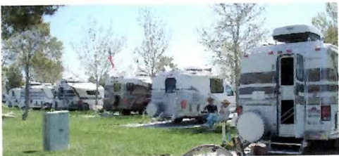
Chinook RV Club