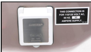
Electrical connections by stowed cord LED Taillights