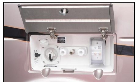
Water connections, 110V out-