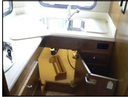
LED's under kitchen sink and all cupboards