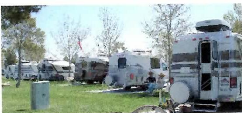
Chinook RV Club