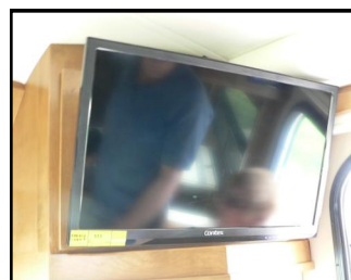
Flat screen TV, swings open.