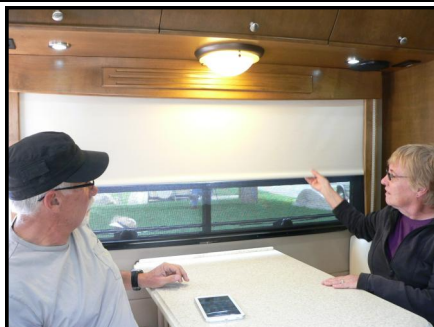
Window screen & separate solid night shade