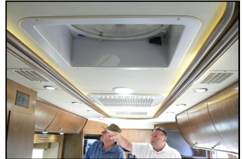
LED Mood light in ceiling