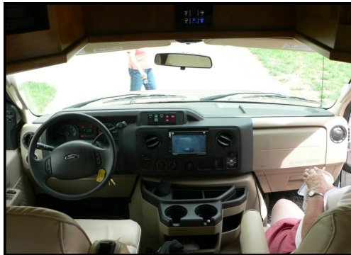
Dashboard with video display in center