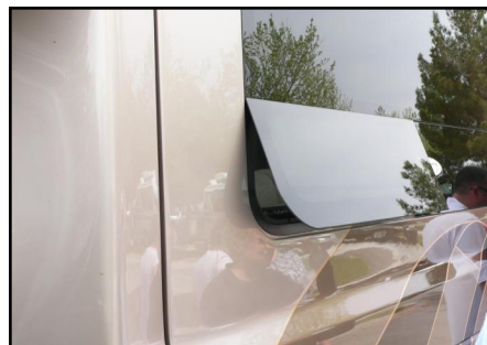
Bottom portion of windows open out.