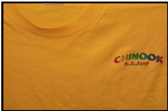
On my golden colored T-shirt