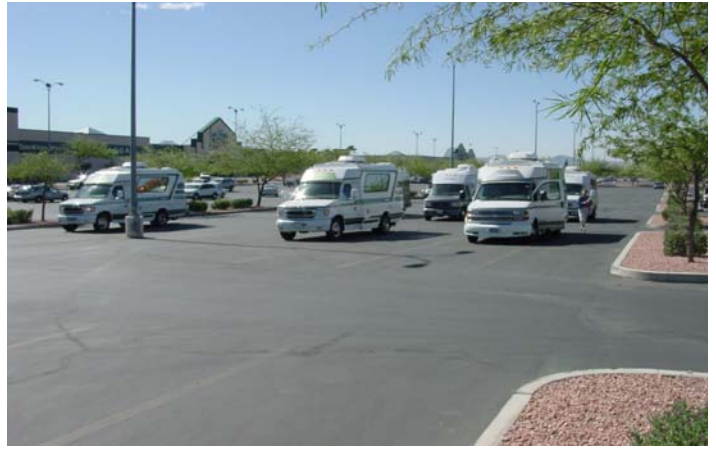
Lining up for the "start" at the Outlet Center