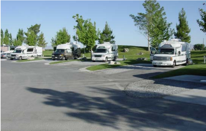
Terrible's Lakeside Resort