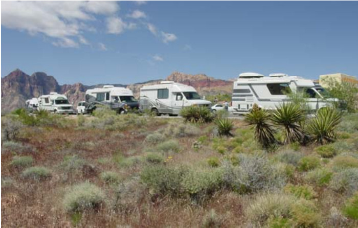
Red Rock Visitor's Center