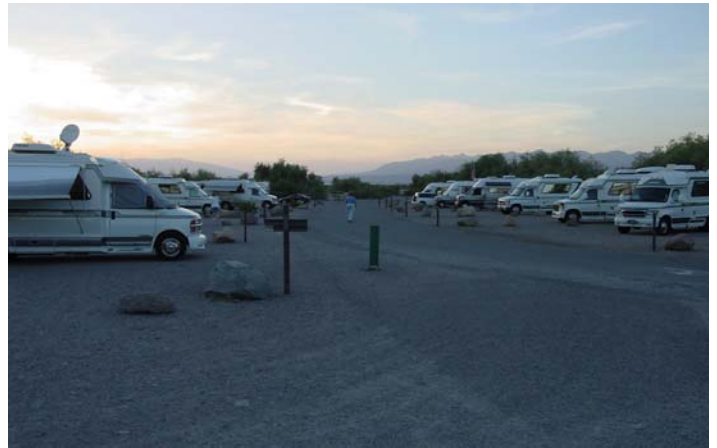
Furnace Creek Sunset