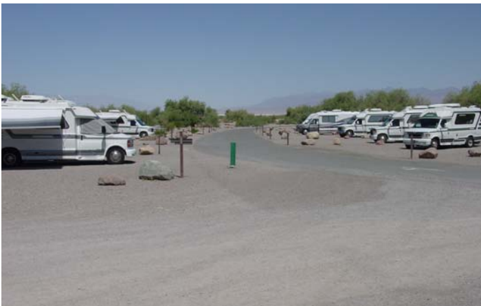
Furnace Creek Campground (a little drier)