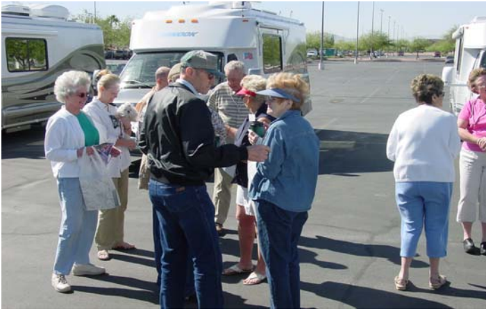
GrOup of "nine" meeting in Las Vegas