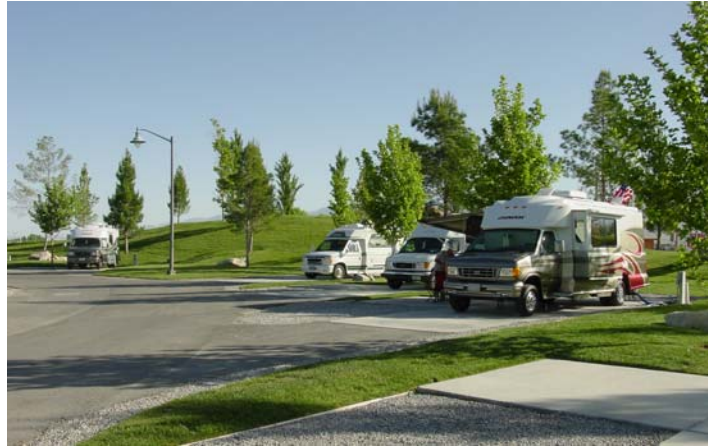
Nice Place, Huh!