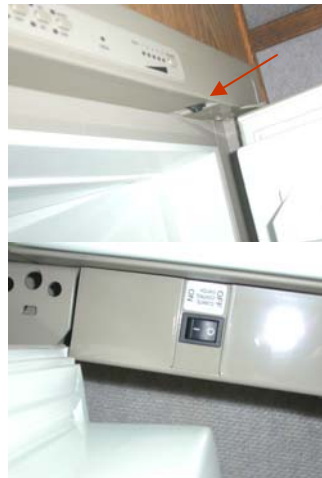
Climate Control Switch

ON position. It should be turned OFF when a charging