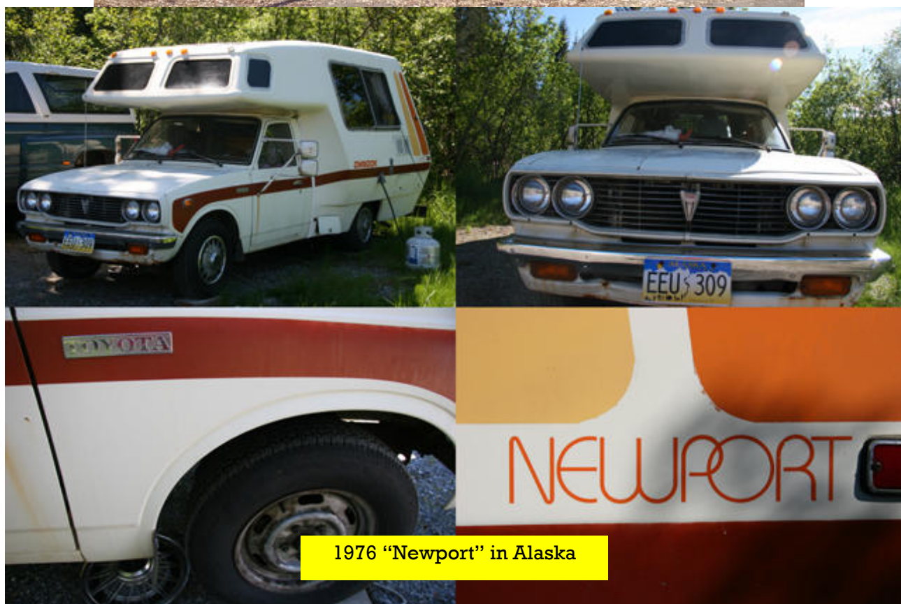
1976 "Newport" in Alaska