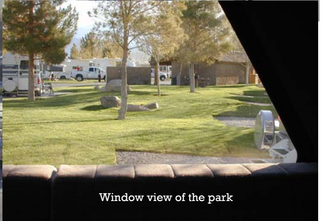
Window view of the park