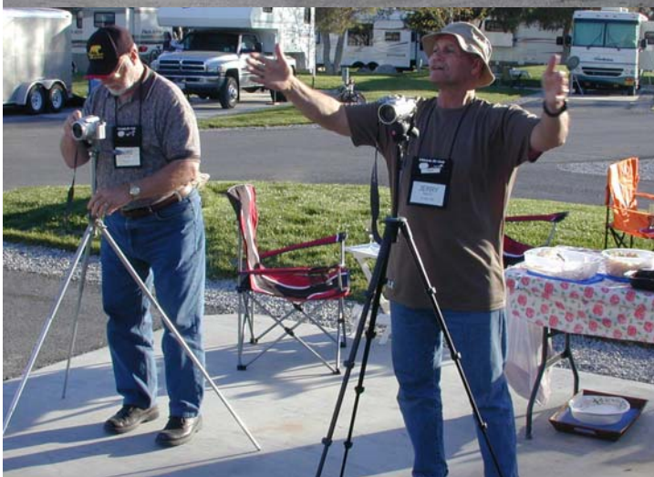
Come On! Get Closer.