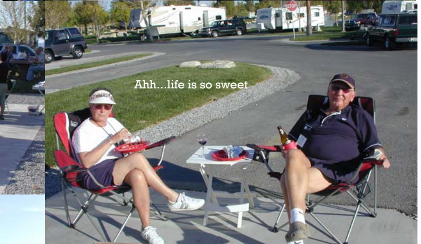
Ahh...life is so sweet