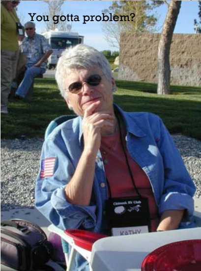
You gotta problem?