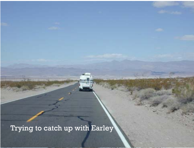
Trying to catch up with Earley