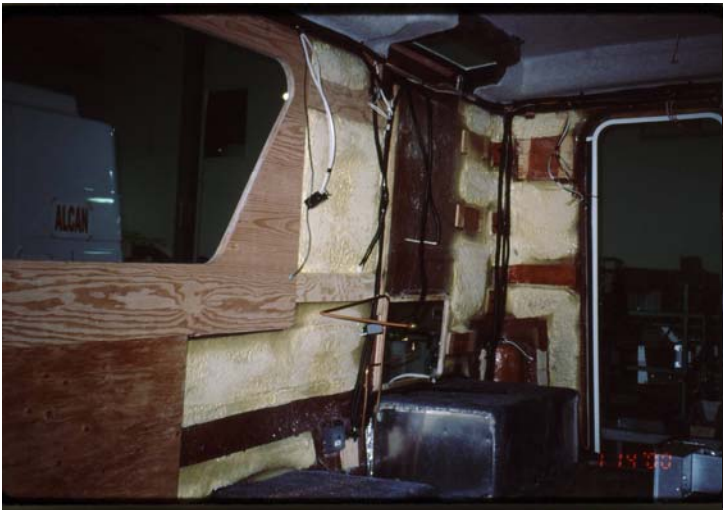
Concourse Refrig/Stove area