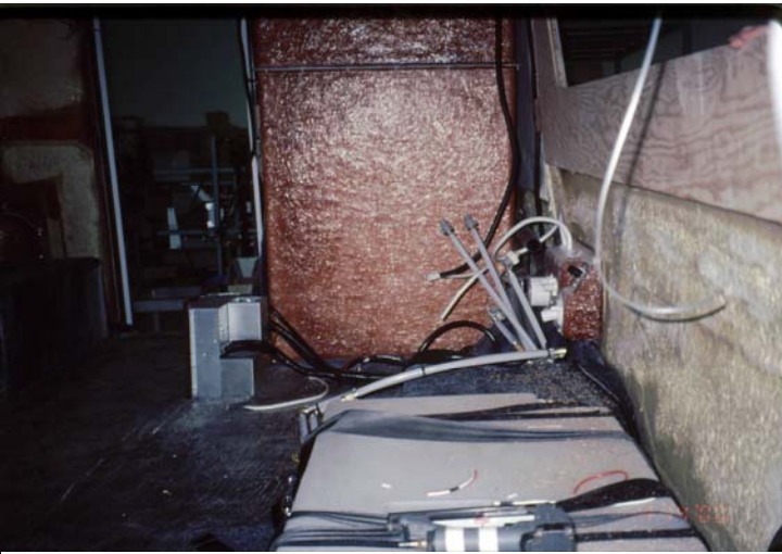
Concourse sink area with water tank