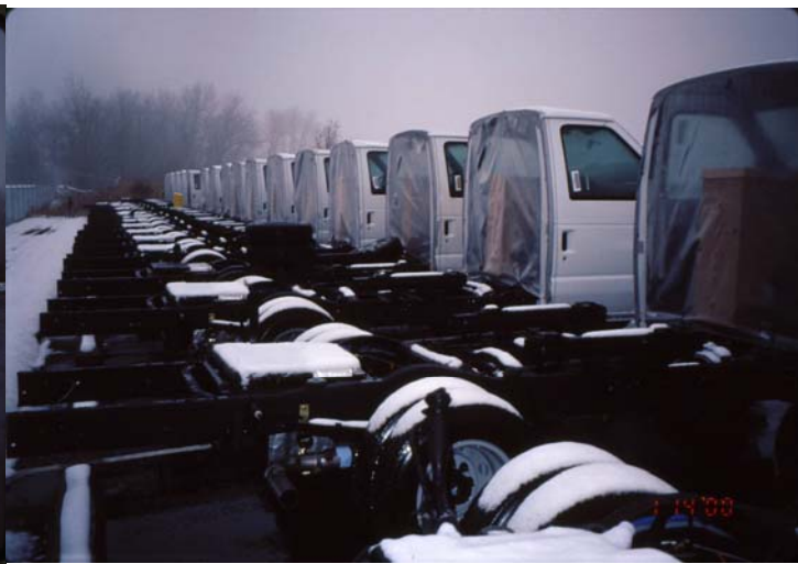
Chassis at the ready