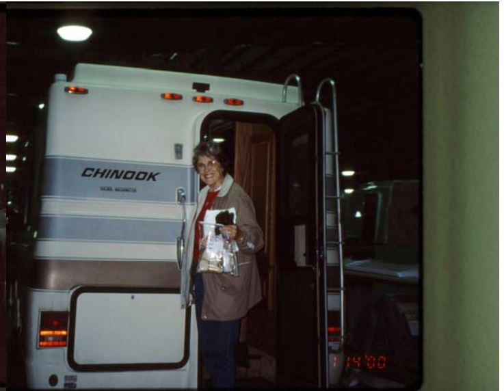
Happy Mrs. Editor