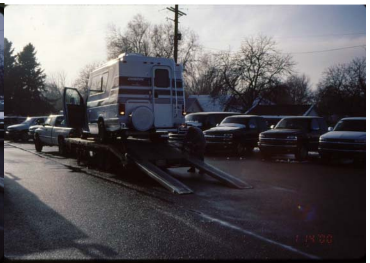
Transport to Customers