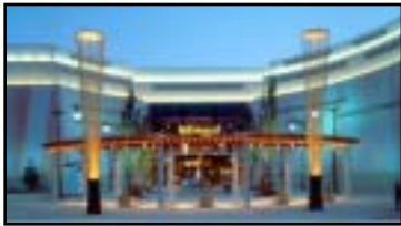
Nashville KOA Nashville, TN October 21 - 24, 2004 http://www.koa.com/where/tn/42148.htm

ANNUAL RALLY - OCTOBER 21 - 24 NASHVILLE TN KOA