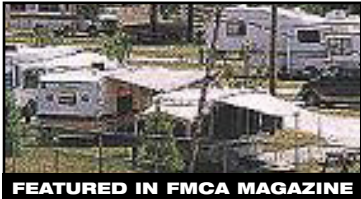
FEATURED IN FMCA MAGAZINE

Renfro Valley Entertainment Center Renfro Valley, KY June 10 – 12, 2004 www.renfrovalley.com